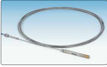
● Model 4500HT shown with TEC cable (coiled, pre-installed configuration).

are possible and the frequency output signal is not affected by changing cable resistances (caused by splicing, changes of length, terminal contact resistances, etc.), nor by penetration of moisture into the electronic circuitry. A secondary vibrating wire temperature sensor (or thermistor), located in the same housing, permits the measurement of temperatures at the piezometer location.